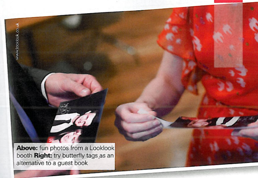
Above: fun photos from a Looklook booth Right: try butterfly tags as an alternative to a guest book