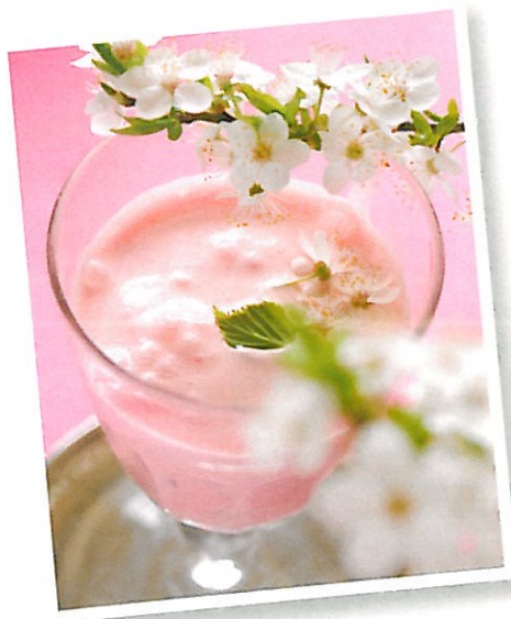
Left: create a bespoke cocktail Below: doughnuts or a sweetie tablemake a fun alternative to traditional cake